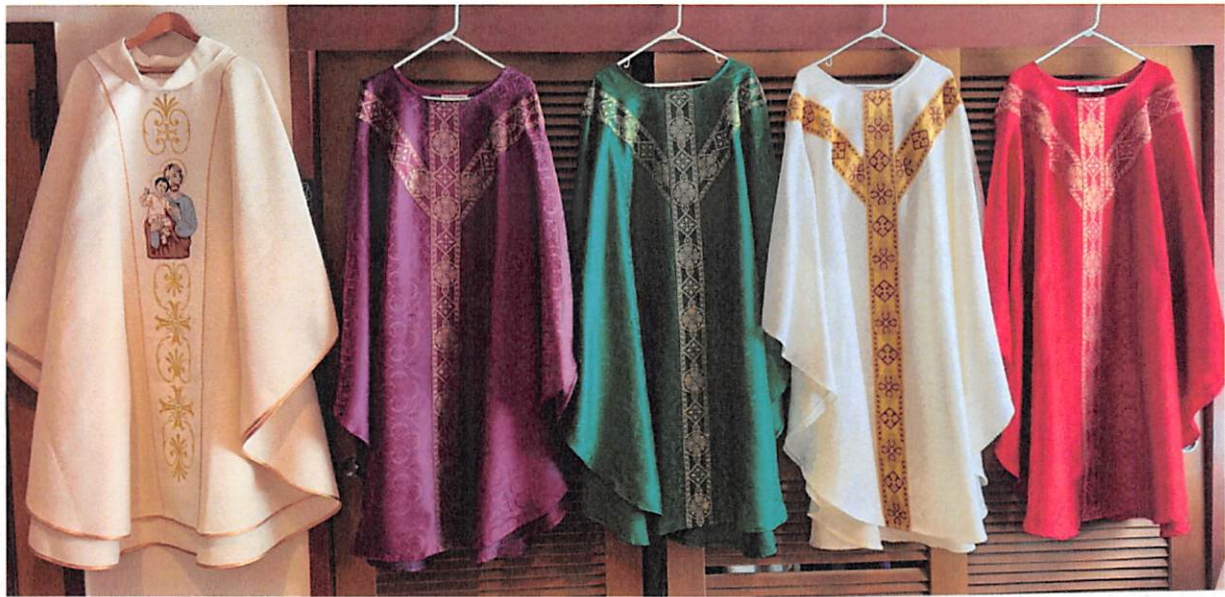
St. Joseph Vestment