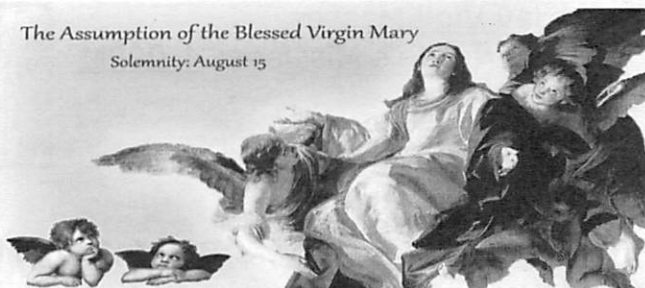
The Assumption of the Blessed Virgin Mary Solemnity: August 15

1 Kgs 19:9a,11-13a Ps 85:9-14 Rom 9:1-5 Mt 14:22-33